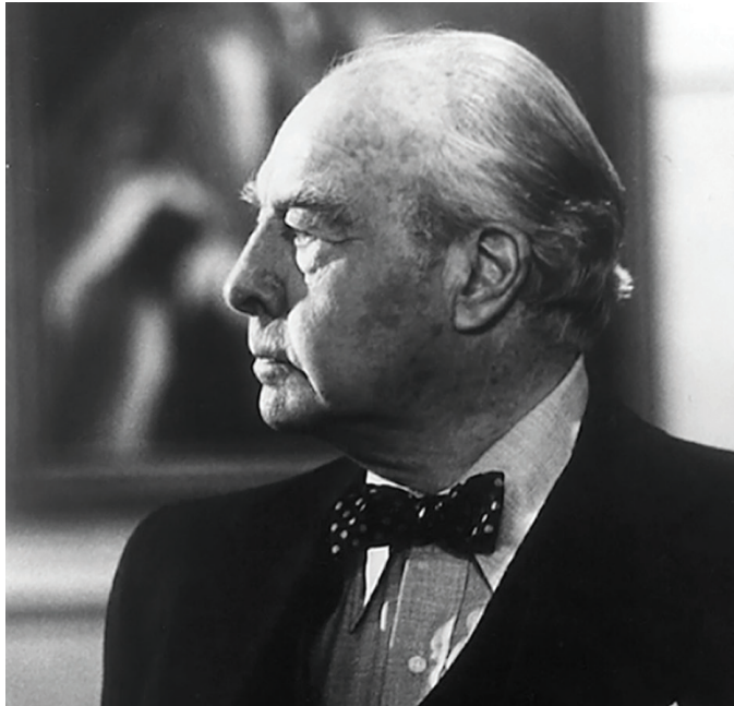
20th Century Fox Film