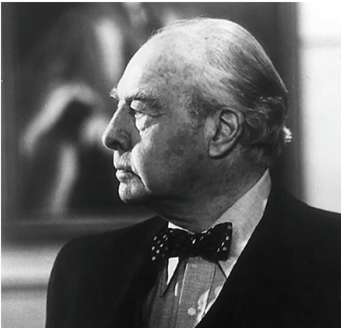
20th Century Fox Film