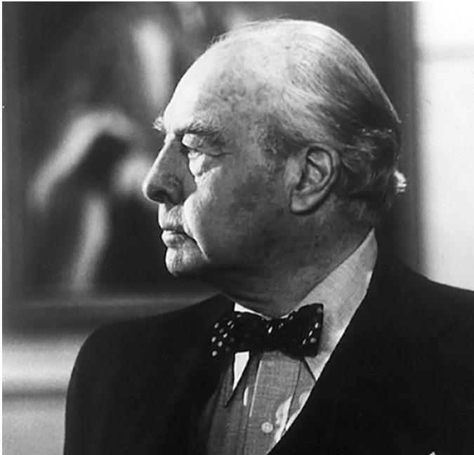
20th Century Fox Film