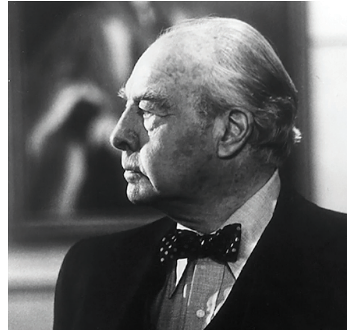
20th Century Fox Film